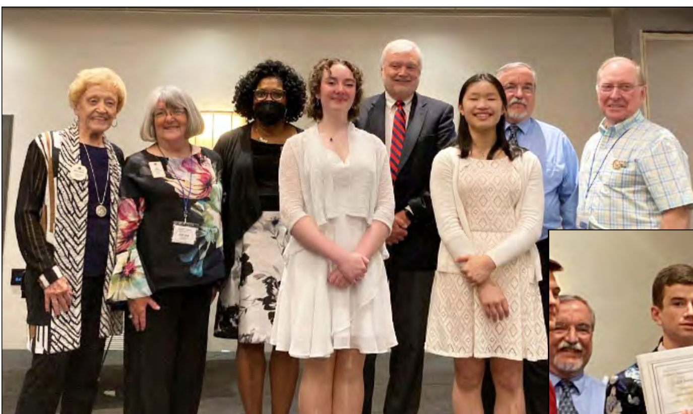
Bland Committee and Award Recipients