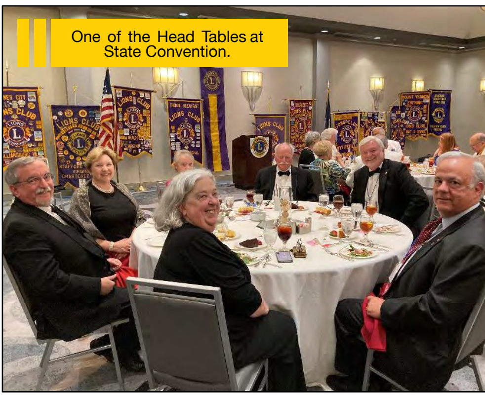
One of the Head Tables at State Convention.