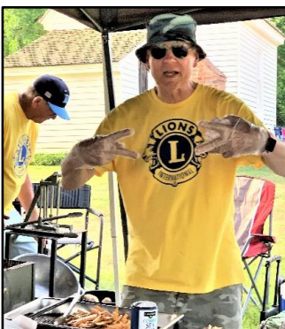
Charlotte County Lions Club