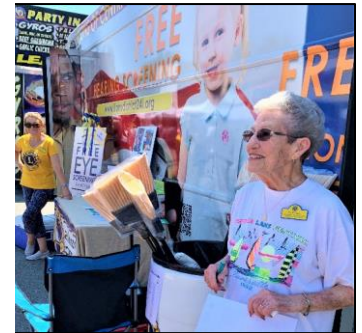
Clarksville Lions Club