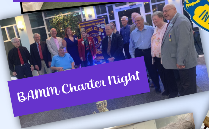
BAMM Charter Night