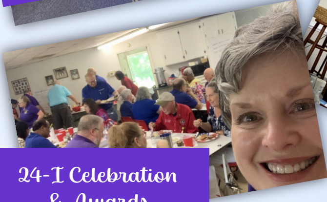
24-I Celebration & Awards