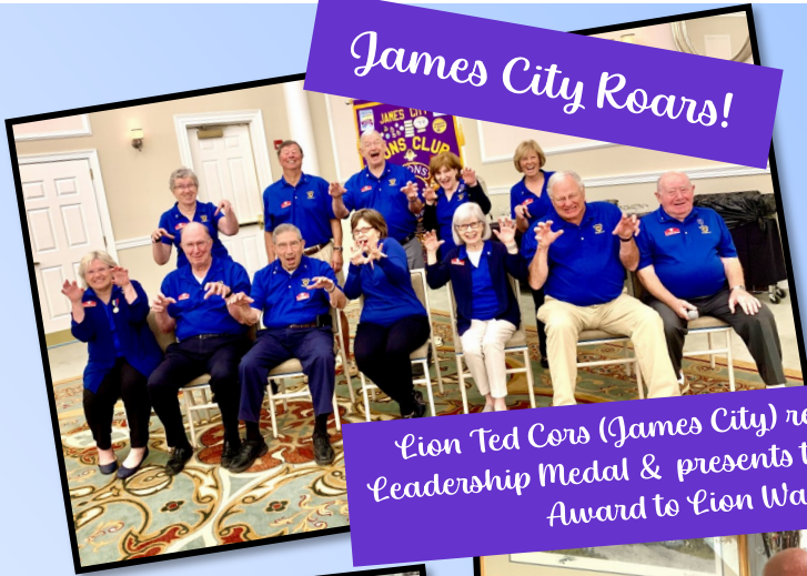
James City Roars!