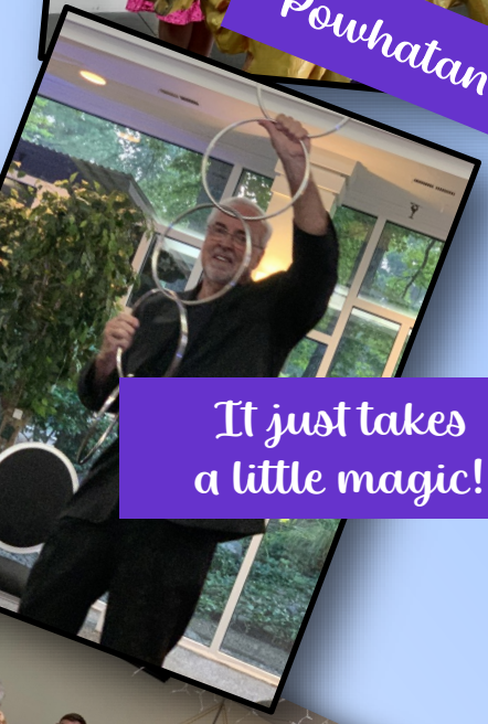
It just takes a little magic!