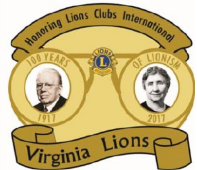
2017 LOV Prestige Pin

SEND ALL ORDERS TO: PCC BILL SMITH 3643 OSBORNE DRIVE WARRENTON VA 20187